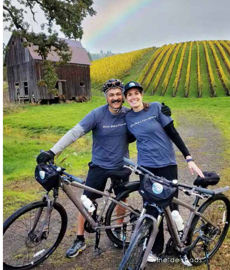
wine de roads